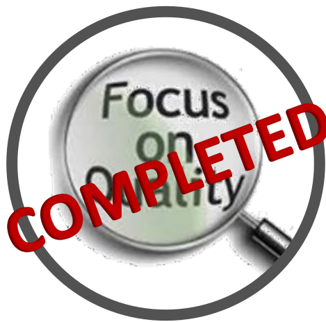
Clinical Quality Forum April 17, 2024

Individual event sponsorships and bundled sponsorships are available.