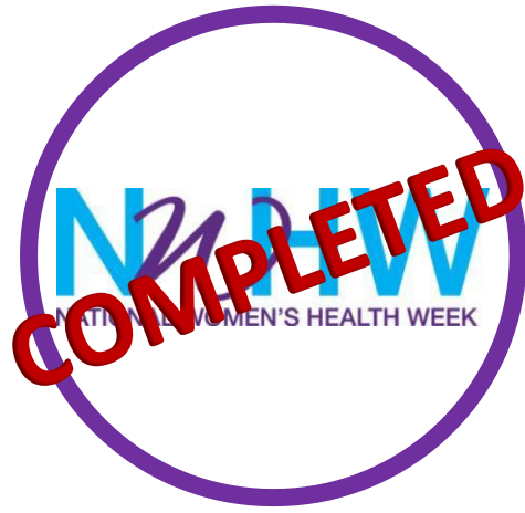
Annual Women's Health Week Luncheon May 17, 2024