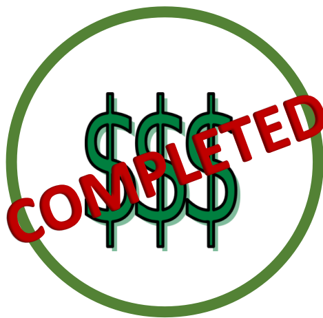
Financial Roundtable Summit June 2024